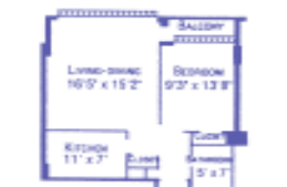
Large One Bedroom 487 sq. ft