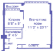
Bachelor 375 sq. ft

Layouts shown below are only approximate and vary by location in buildings.