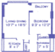
One Bedroom 398 sq. ft